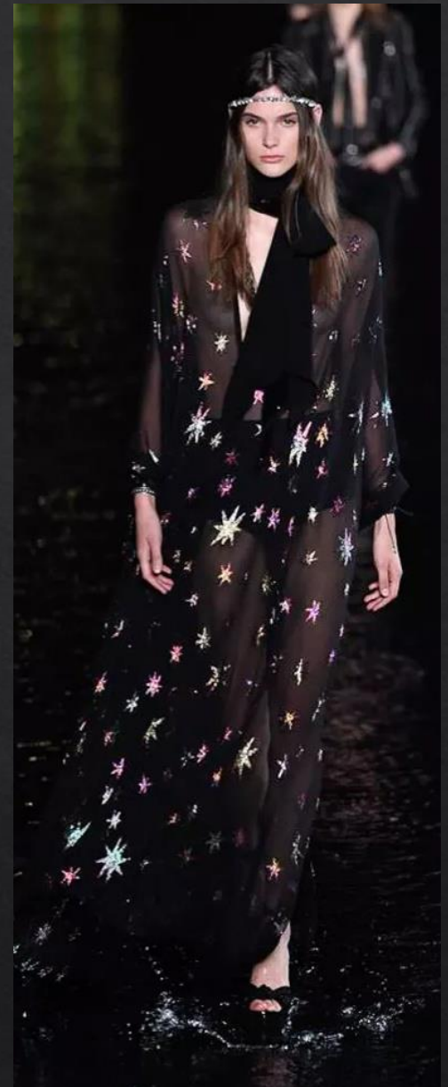
Saint Laurent f/w 19