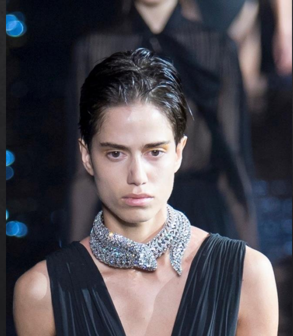
Saint Laurent f/w 19